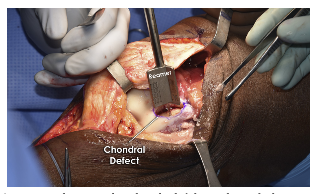
Fig 5. A guide pin is placed in the left knee through the center of the sizer, and the sizer is removed and replaced by a reamer. The chondral defect is reamed to the depth at which bleeding healthy subchondral bone is encountered. During reaming, the area should be copiously irrigated to ensure overheating does not occur.

with a final measurement. During reaming, a copious amount of irrigation fluid at room temperature is used to avoid heat necrosis of the surrounding articular cartilage and subchondral bone. The recipient site is then dilated with a smooth cylinder (Arthrex) (Fig 6) several times to ensure the donor plug can be inserted without the need to apply too much pressure. To accomplish a perfect fit between the donor graft and the host socket, a compass reference is created on the prepared defect and measures are taken from each main coordinate (north, south, east, and west). These measurements will be used later, at the time of graft trimming.