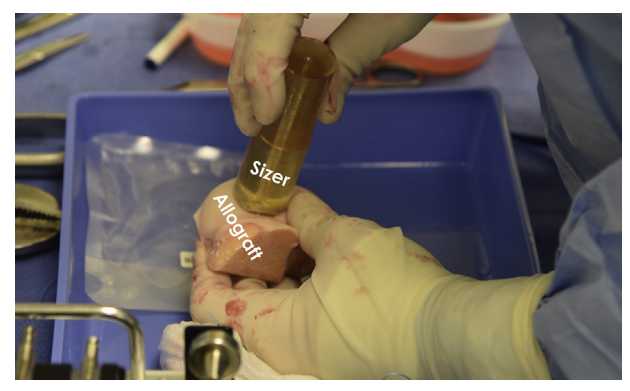
Fig 4. The same sizer that was used to measure the size of the trochlear defect is used on the allograft to ensure the graft is large enough.