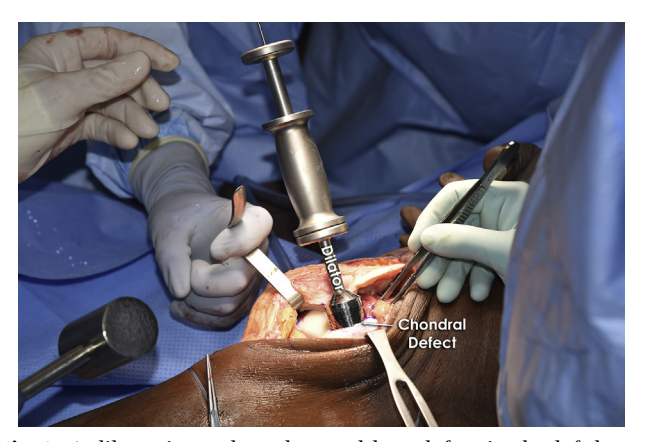
Fig 6. A dilator is used on the trochlear defect in the left knee repeatedly to facilitate implantation of the donor osteochondral allograft.

The patient should remain non-weight bearing for the first 8 weeks. A supervised rehabilitation program