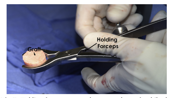
Fig 7. Holding forceps are used to grasp the graft while the graft is trimmed to fit the exact depth dimensions of the patient's now-reamed chondral defect. Care should be taken to ensure the measurements are correct before this step.

Next, the corresponding area on the allograft is outlined, by use of the sizer that had previously been used to measure the trochlear defect, with methylene blue to match the dimensions of the patient's knee defect. Of note, the area to be replaced should match the area of the donor site. The donor condyle is then secured within an allograft workstation (Arthrex) to ensure precision during harvest. The osteochondral donor plug