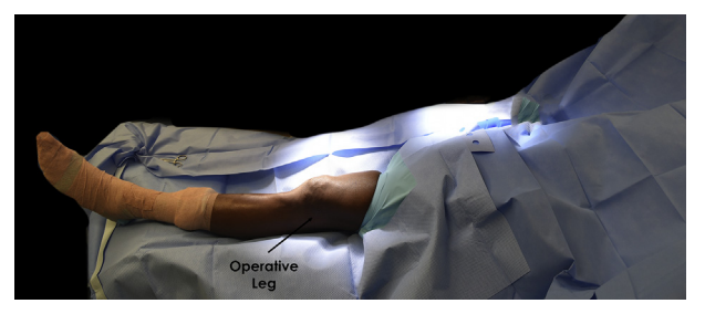
Fig 1. Patient positioning. The operative (left) leg is prepared and draped in sterile fashion. Coban (3M Company) is wrapped around the calf and extended distally around the patient's left foot. The surgeon should ensure that sufficient work space is exposed around the patient's knee.

results.<sup>10,11</sup> Advantages compared with other techniques include the following: It is a 1-stage procedure, there is no donor-site comorbidity, the graft is designed according to the shape of the defect with a similar load area between the donor and the host, and the procedure can be combined with additional procedures. The main disadvantages are the risk of immunologic reactions and disease transmission. The purpose of this Technical Note is to describe a reproducible surgical technique for addressing large chondral defects of the trochlea that allows for preservation of most of the patient's native cartilage and bone and allows for a quicker recovery than some regeneration techniques.