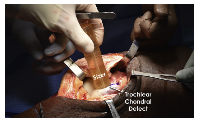
Fig 3. Once the defect has been properly exposed, identified, and marked with a surgical pen in the left knee, a cannulated sizer is used to ensure proper sizing of the osteochondral allograft.

The patient is placed in the supine position on the operating table, and general anesthesia is used for induction (Fig 1). A well-padded high-thigh tourniquet is subsequently placed on the operative leg, and a bump is placed under the knee so that it rests at approximately 30° of flexion. The contralateral leg is secured to the table in full extension with a pneumatic compression device to help prevent deep vein thrombosis.